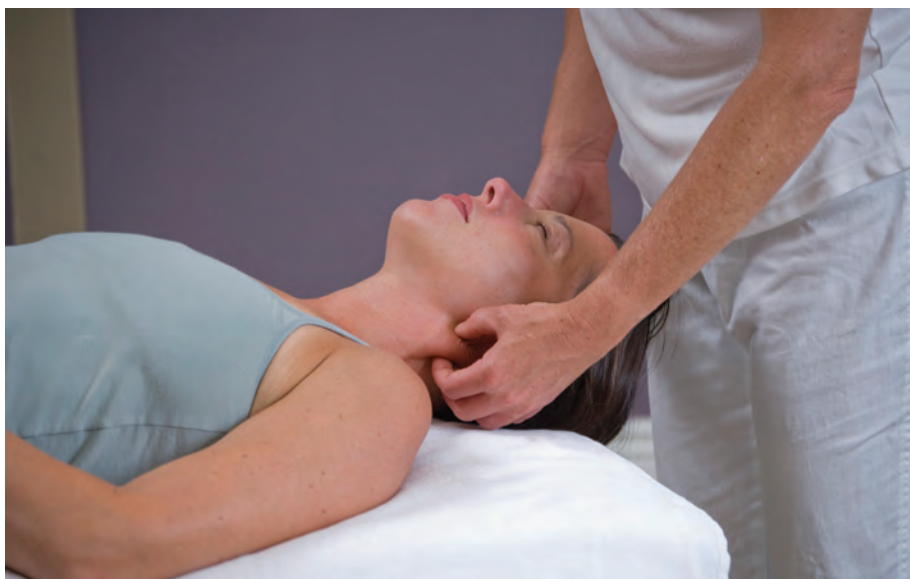
The upper respiratory procedure can help with lymphatic drainage, sinusitis, and hay fever.

The Bowenwork “move” can be described in four distinct stages: contacting the skin, taking the slack, applying the challenge, and rolling over the tissues. ”