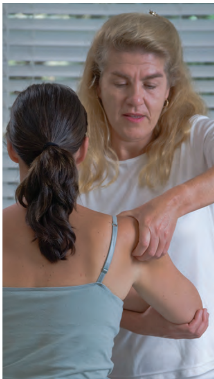
Bowenwork may be done with the client seated, as seen with the shoulder procedure.

Many of my clients find Bowenwork helpful for transitioning major life changes, emotional distress, hormonal changes, recurrent stress, headaches, and physical injuries. Bowenwork “resets” their muscles and nervous